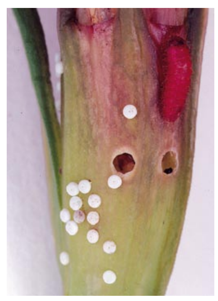
Bud of G. pneumonanthe with eggs, larva and "flight holes" of caterpillars, which left the bud

Populations which live on the comparatively early flowering G. pneumonanthe can cope with this loss in most cases. In contrast this mowing date is a serious threat for populations which live on G. asclepiadea , as it can lead