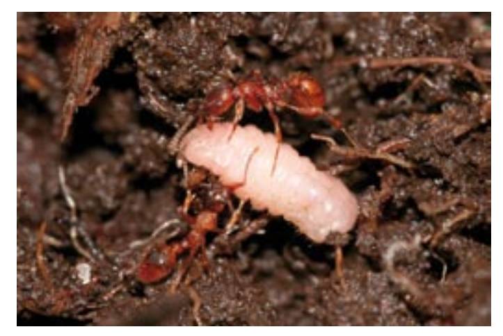
Caterpillar in a host ant nest

tion structure of the habitat. Furthermore this method can be used to meet the specific habitat needs of the host ants.